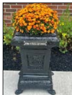
Class gift from Class of 2022.

As Veterans Day approaches, we would like to take a moment to recognize and express our deep gratitude to all the veterans in our community and beyond. Veterans Day, observed on November 11th, is a time for us to honor and pay tribute to the brave men and women who have served and continue to serve our country in the armed forces. As a community, let us come together to recognize the bravery and dedication of those who have served our country. We extend our heartfelt thanks to all veterans for their service and sacrifice. Your contributions have shaped our nation, and we are forever grateful. We would like to honor the veterans in our community each day throughout the month of November. Please consider submitting your veteran's name into this google form to be highlighted this upcoming month!